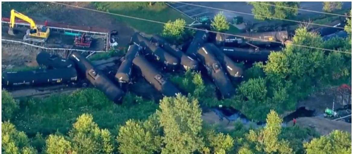
An oil train derailed in Plainfield in July 2017 shutting down a Canadian National rail line and many roads in the area including State Route 126. About 40,000 gallons of oil leaked from ruptured rail cars. Fortunately, no fire or explosion occurred as the result of the accident, limiting the effects.