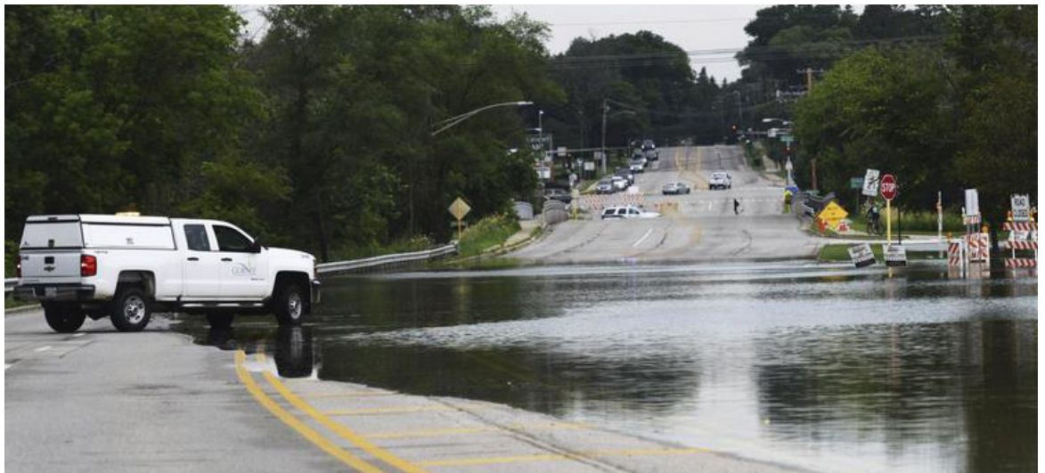
State Route 132 (Grand Avenue) in Lake County was closed to traffic at the Des Plaines River in July 2017 after several inches of rain fell on the area. Many arteries in Chicago's northern suburbs, including many major east-west roads crossing the Des Plaines River, were closed due to flooding, causing travel headaches and disrupting commutes.

While detailed asset and location cannot be provided due to security reasons, the vulnerability assessment performed as part of the recently completed Illinois All-Hazards Transportation System Vulnerability Assessment concludes that the following percentage of IDOT's assets should be given priority as part of the state transportation planning process, based on the importance of and risk to the asset.