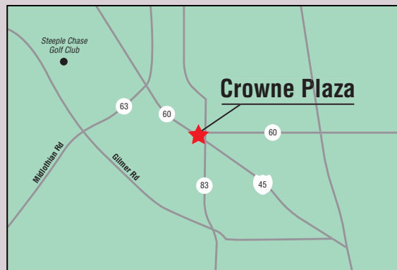
★ - Crowne Plaza (formerly Holiday Inn)