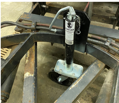
Cost for parts to build the system is approximately $200. Jack lugs for use on additional plows run $30.