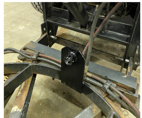
The system can be built in less than two hours.