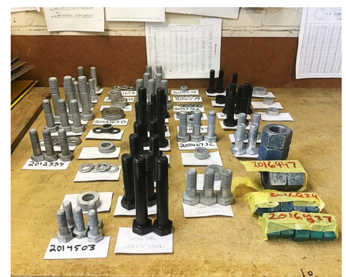
Inspectors would be able to complete sampling within minutes, compared to the hours of travel otherwise required.