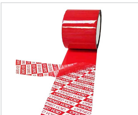
State inspectors will provide tamper-proof tags and labels and watch as they are attached to the sample materials.

Real-time sampling would be a way for trained State of Illinois inspectors to remotely visit out-of-state producer and supplier facilities for material sampling. Using an approved communication platform, such as CISCO WebEx or Facetime, state inspectors can verify the heat and lot numbers associated with stockpiles and select random samples right from their desk. When third parties perform sampling, they typically charge a minimum half day at a rate of $300. With real-time sampling, IDOT inspectors would be able to do the sampling for the cost of a few secure, serialized tags or labels. Additional savings would come from reduced overtime and vehicle wear and tear, along with increased employee safety.