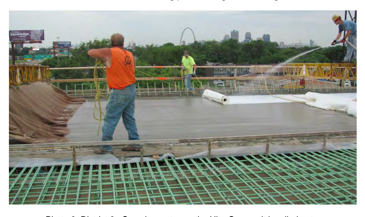
Photo 3: District 8. Spraying water on the UltraCure as it is rolled out.