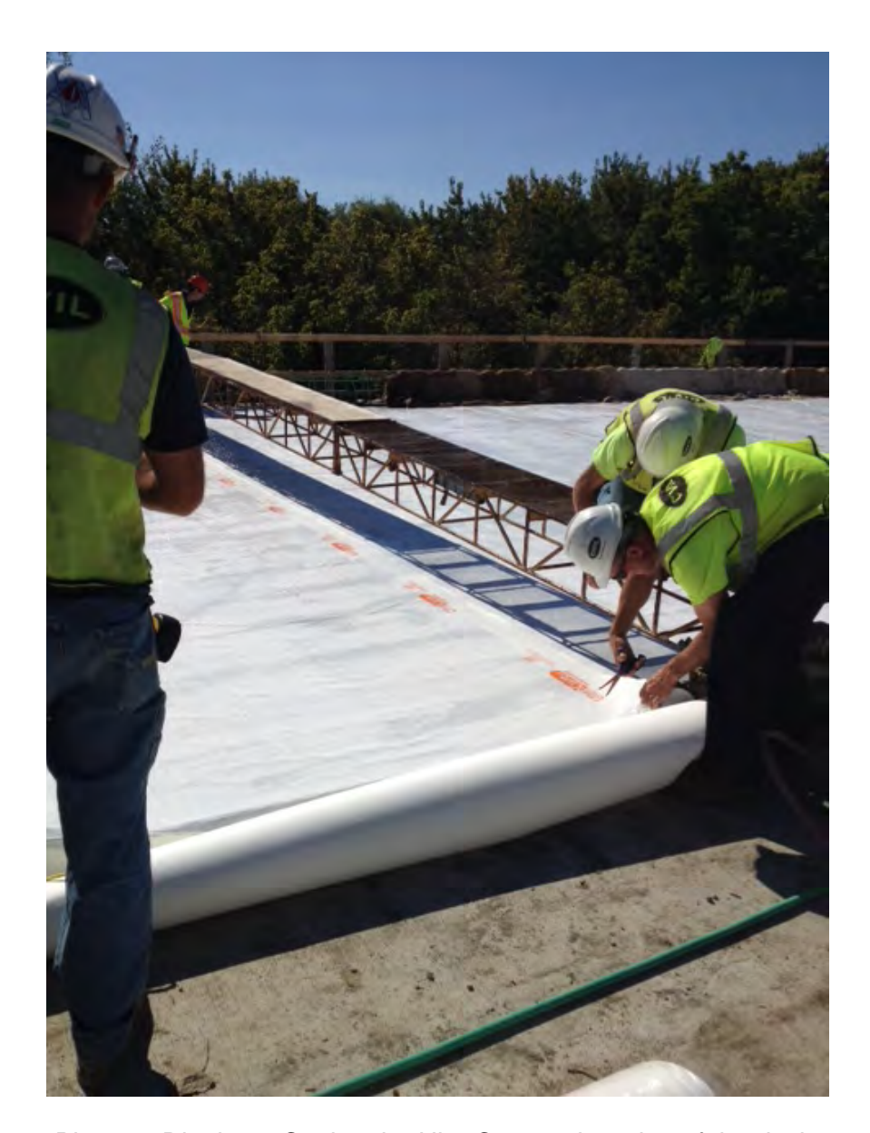
Photo 7: District 2. Cutting the UltraCure at the edge of the deck.