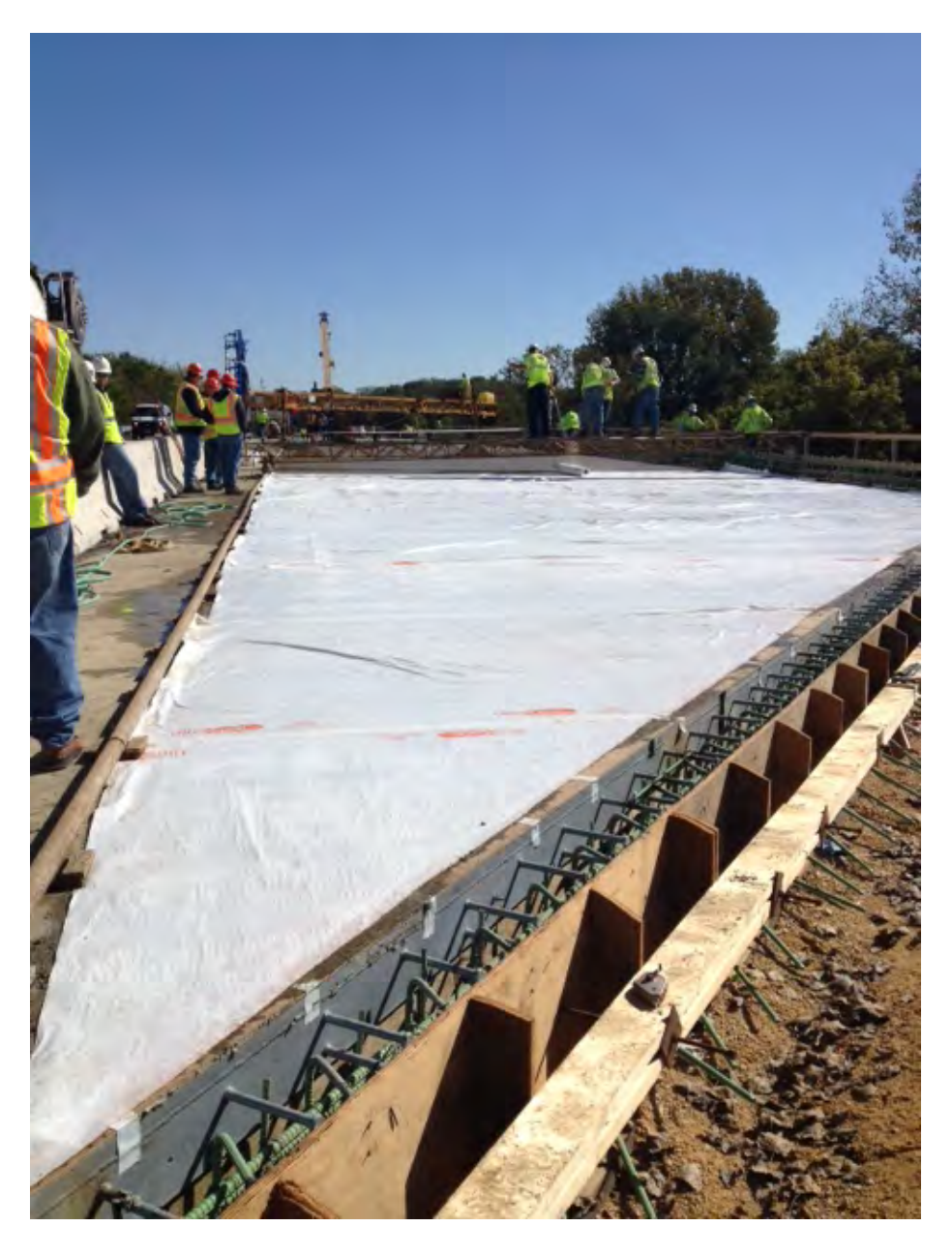
Photo 4: District 2. Hand placed UltraCure at the start of the skewed deck.

Civil Constructors constructed the bridge deck in District 2, which was placed on a skew. The contractor placed the UltraCure by hand until the full width of the deck was reached, see Photo 4. The "wedding runner" method was used to place the UltraCure across the pavement with the workers standing on runners on each side, see Photos 5 and 6. The contractor placed the rope through a metal pole that was placed inside the roll. While workers were rolling the UlraCure, another worker sprayed the blanket with an initial layer water to give the blanket enough water during its immediate application, see Photo 6. The UltraCure had to be cut using industrial scissors after the roll had reached the edge of the deck, see Photo 7. Once the UltraCure was placed, a worker sprayed additional water to saturate the blankets, see Photo 8.