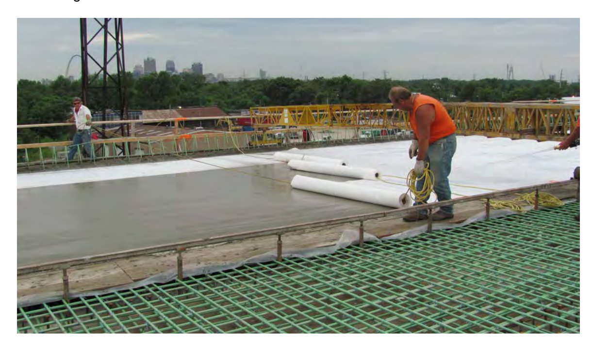
Photo 2: District 8. UltraCure mat being placed using the "wedding runner" method.

be pulled by workers on the side of the deck behind the paver. This "wedding runner" method is shown in Photo 2. Another worker used a hose to water the UltraCure as it was being rolled.