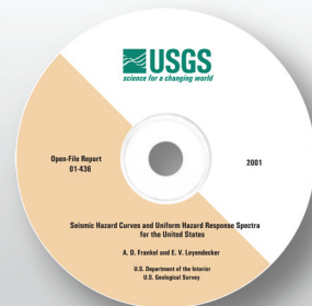
USGS: Seismic Hazard Curves and Uniform Hazard Response Spectra for the United States