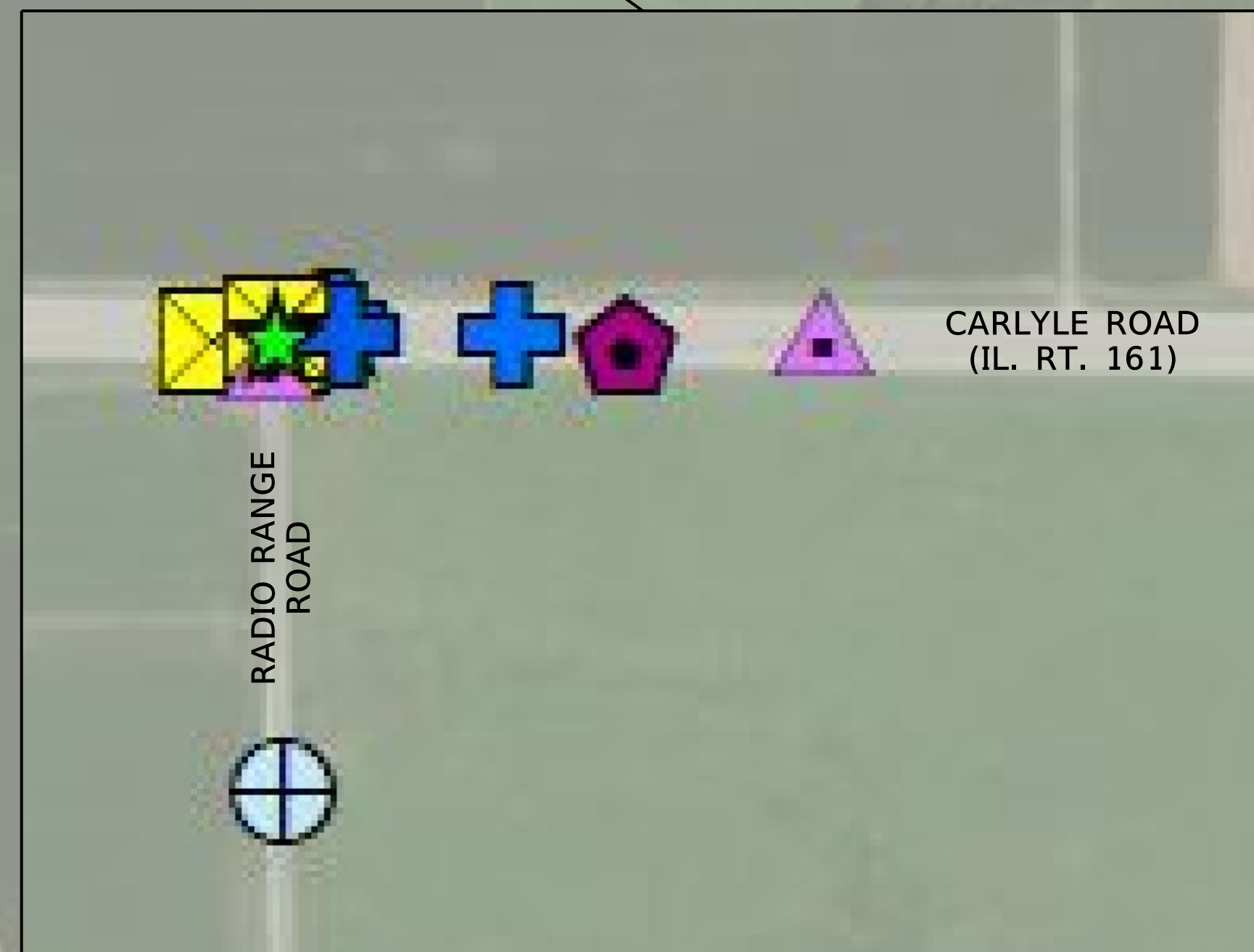
ENLARGED VIEW INTERSECTION IL RT. 161 / RADIO RANGE RD. (CRITICAL SAFETY TIER LOCATION)