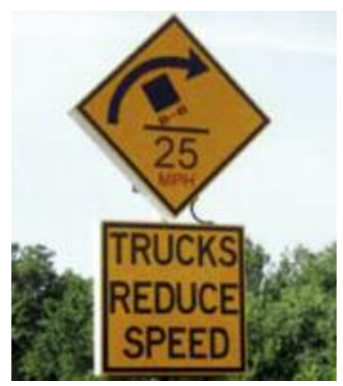
LEDs are embedded in the symbols and lettering on this truck warning sign.

• A statistically significant decrease in vehicle approach speeds ranging from 1.9 to 3.4 miles per hour (mph) with an average of 2.7 mph (a 7 percent decrease) indicated that