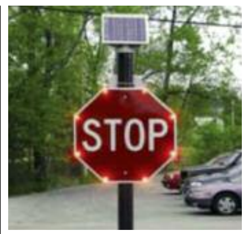
Example of stop sign with embedded LEDs and solar unit.